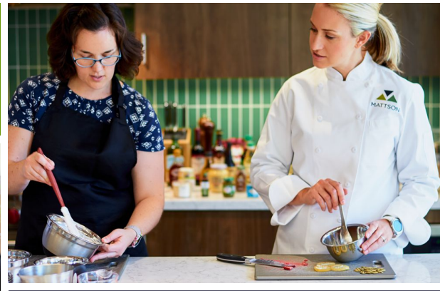
We are a team of 60+

Food Scientists Culinary Experts Strategists Commercialization Specialists Brand Marketers Designers